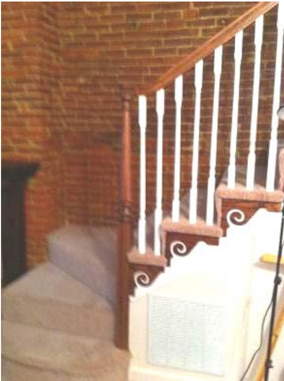
Stairway to 2 nd Floor