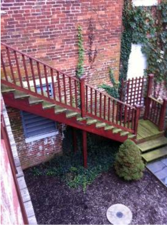
2nd Floor Exit To Parking