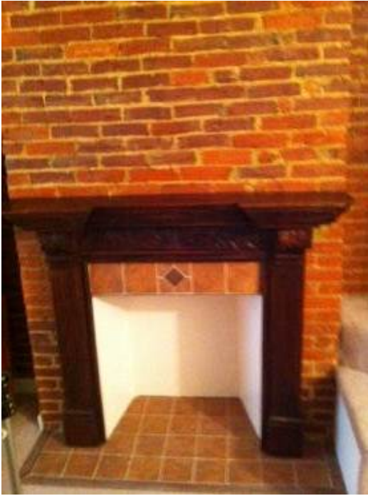
1 st Floor Exposed Brick Walls and Fireplace