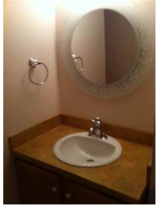
Renovated Interior with Upscale Finishes