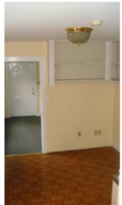
1 st Floor Office With Built-In Shelves