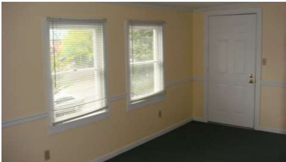
2 nd Floor Office Exit - Windows with Shades