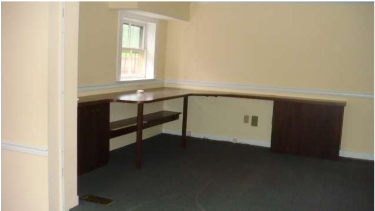
Built In Desk on First Floor Rear Room