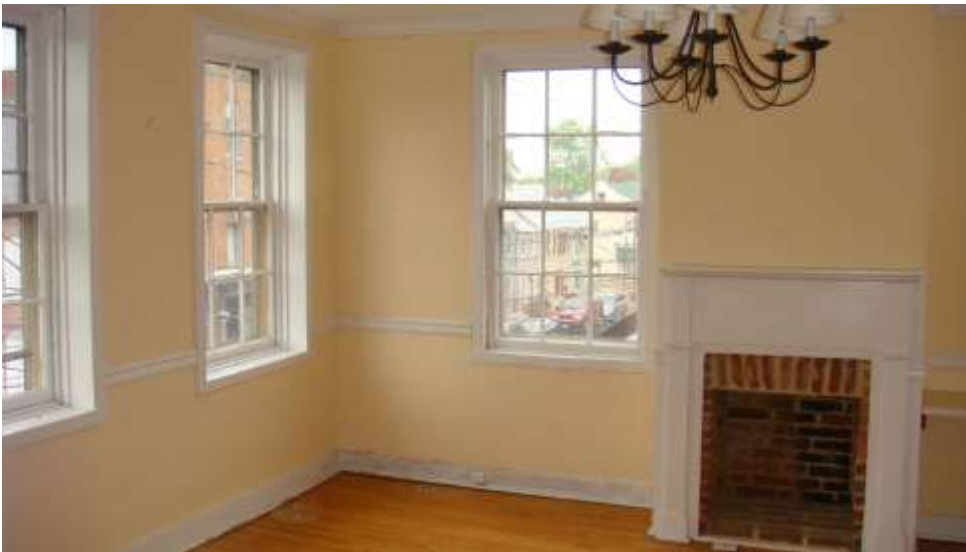
2 nd Floor Front Conference Room