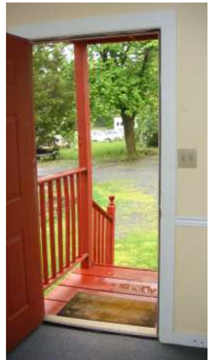
1 st Floor Exit To Parking