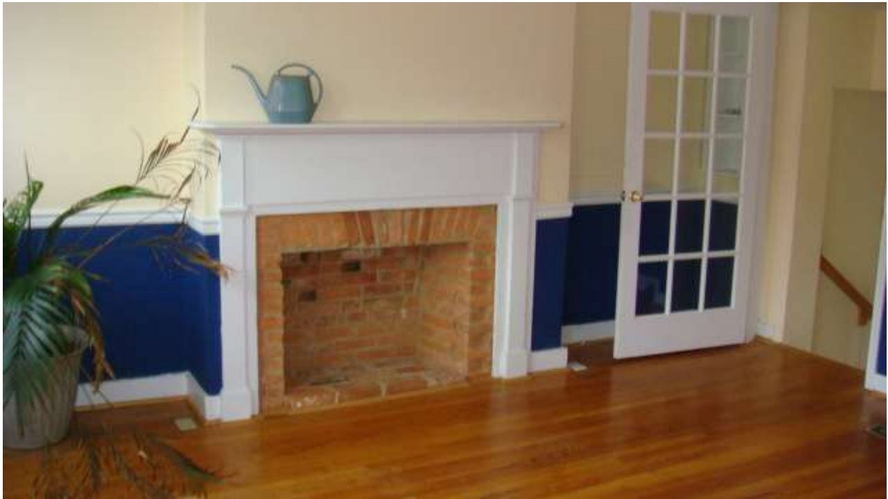
First Floor with Fireplace – French Doors and Harwood Floors