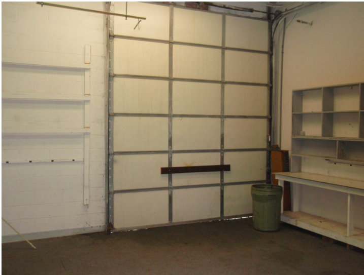
Warehouse Area with OH Door