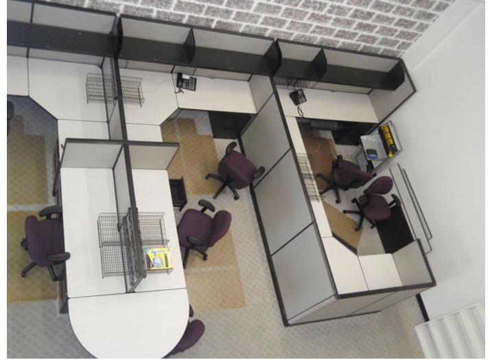
Front Office Area